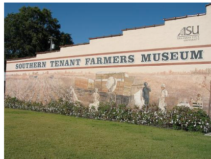
Southern Tenant Farmers Museum, Tyronza