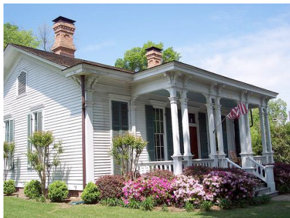
Old Hotze House, Little Rock

Other properties formerly listed on the Most Endangered Historic Places list include the Mitchell-East Building in Tyronza, which now houses the Southern Tenant Farmers Museum; the Rosenwald School in Selma which received a grant from Lowe’s and the National Trust for Historic Preservation for restoration as a community center; and the Stephen H. Chism House in Logan County which is currently being restored by the owner.