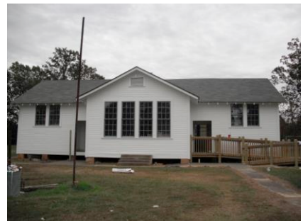
Selma Rosenwald School