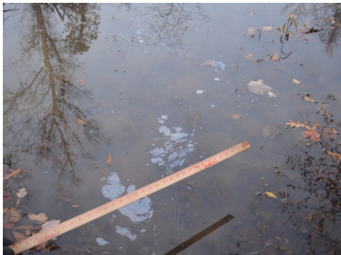
Brittle Metallic Sheen Patch Observation on November 30, 2013 (Dawson Cove Inlet Channel)

Mainly non-brittle sheens were observed in two monitoring areas of Dawson Cove – Dawson Cove Inlet Channel and Dawson Cove Open Water Area (Figure 11-2) between October 21, 2013 and February 23, 2014. Similar numbers of brittle and non-brittle sheens were observed in the B-On Water area. One brittle sheen was observed in the Dawson Cove Outlet. Examples of these are shown in the photos below.