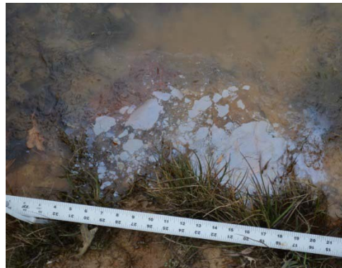
Brittle Metallic Sheen Patch Observation on January 4, 2014 (A-365W)

Patches observed at a single location in these monitoring areas covered typically less than one square foot. Sheen streamers observed in these areas varied in size from 1 inch to 20 feet. At approximately 15 percent of the sheen locations, various patches, cover (no particular structure), and/or streamers covering an area up to 20 feet by 40 feet (up to 70 percent of the water surface) were observed. A summary of sheen observations in the drainage ways is included in the following table.