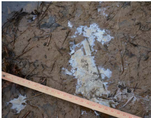
Brittle Rainbow Sheen Cover Observation on December 28, 2013 (A-Main)

In the A-Main, A-365W, and A-365E drainage ways, brittle and non-brittle sheens of metallic, silver gray, and/or rainbow colors were observed along the banks and on the water surface in the drainage swale (Figure 11-1) between October 21, 2013 and February 23, 2014. Examples of these are shown in the photos below.