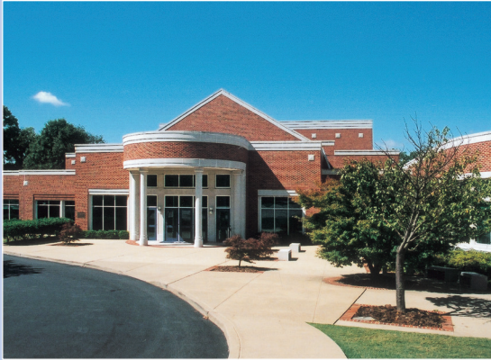
C.G. Mills Complex completed in 1991.

“The addition of the C.G. Mills Complex and the Elizabeth Lupton Davenport Middle School are improvements that I was proud to be a part of, but I would hope that my legacy is that I helped GPS evolve from a school of traditional classrooms to a school of engaging and active learning experiences.”