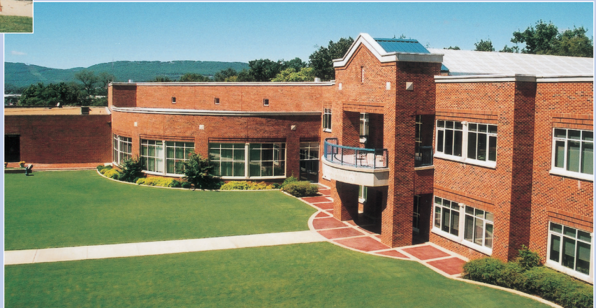
Elizabeth Lupton Davenport Middle School completed in 1999.