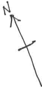
SITE PLAN VANCE AVENUE COURT

RECEIVED NOV 22 2016 City of San Diego Planning Department