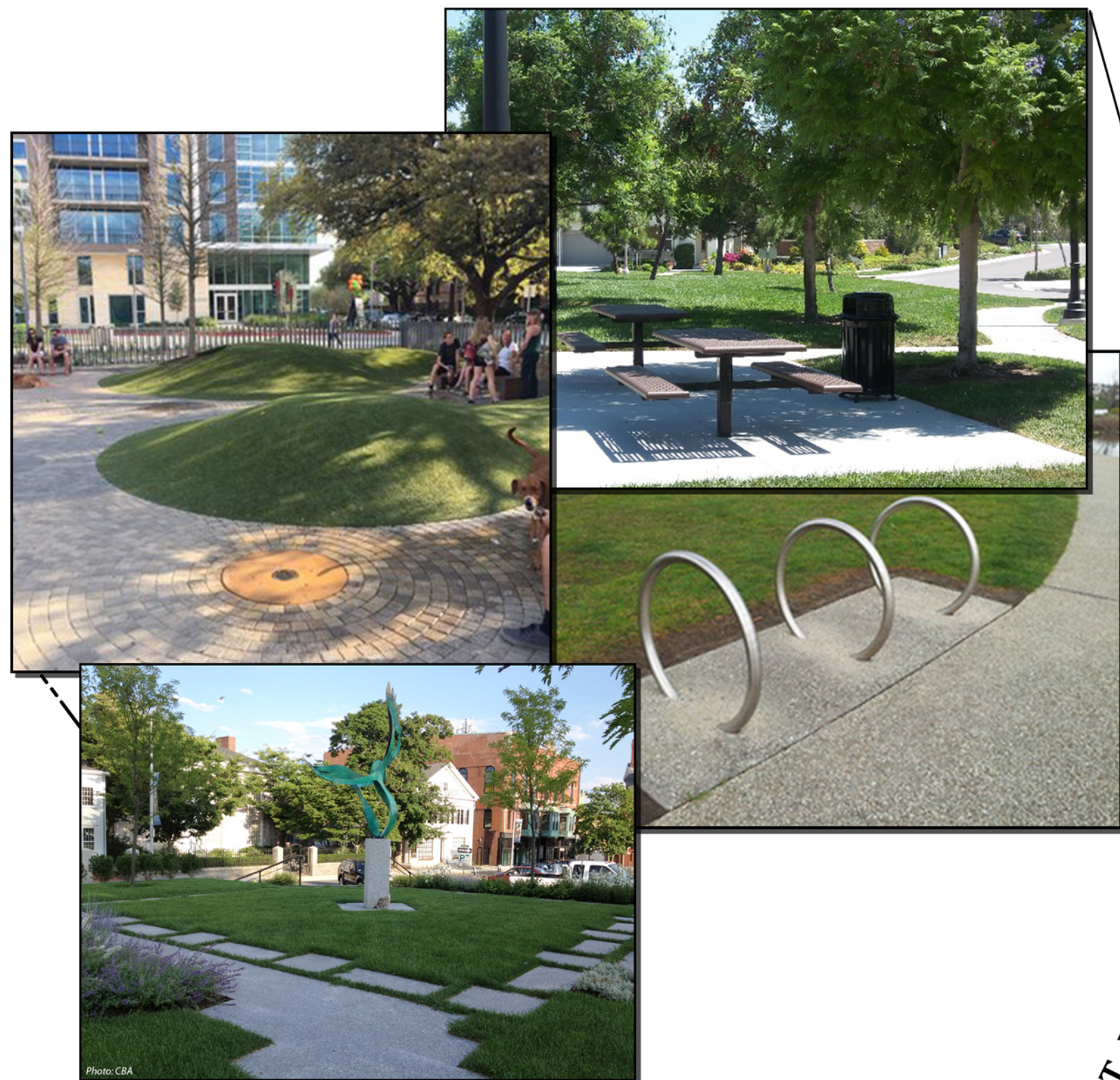
EXAMPLE PARK IMAGES