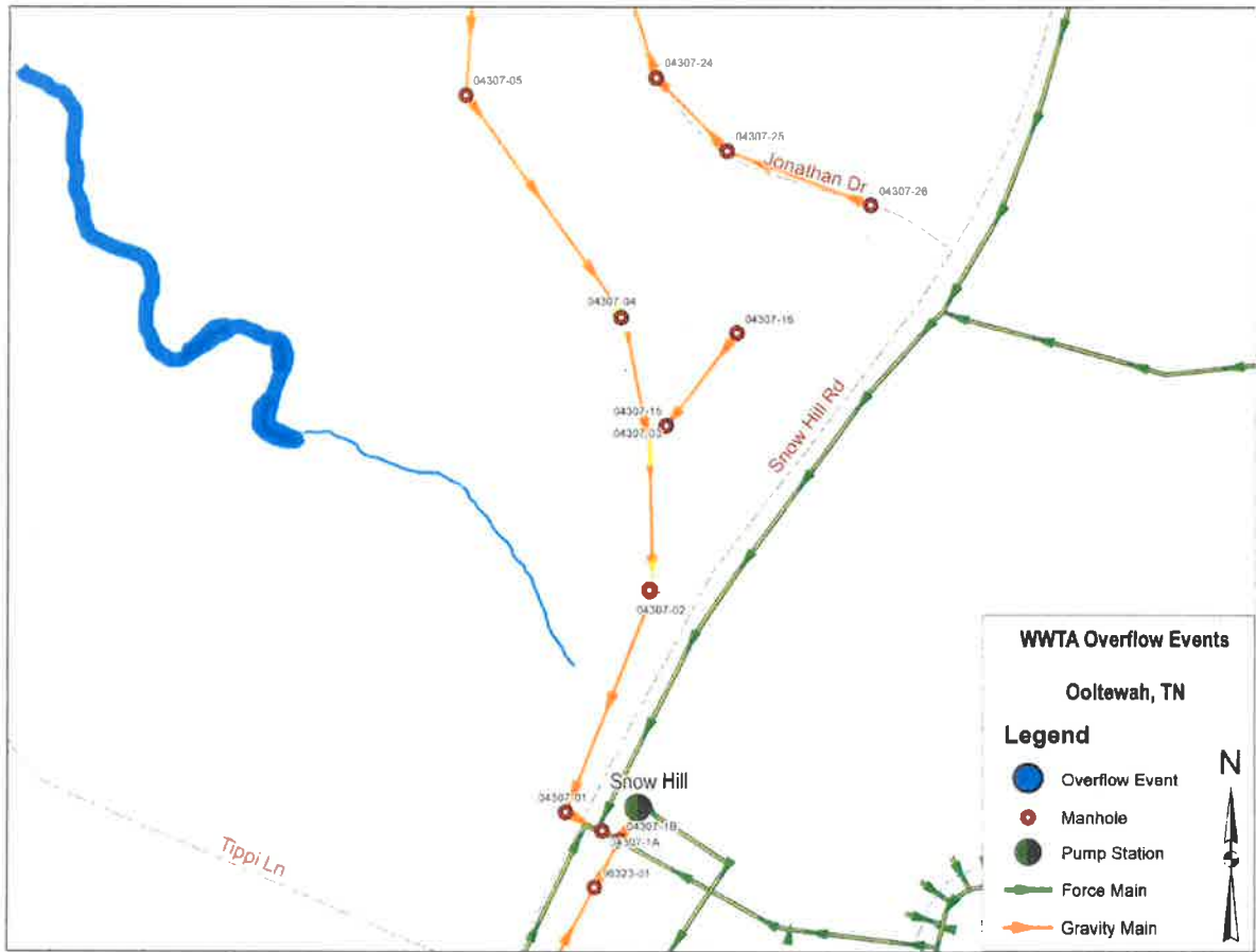
Figure 1. Snow Hill Road. Note proximity to Roger’s Branch