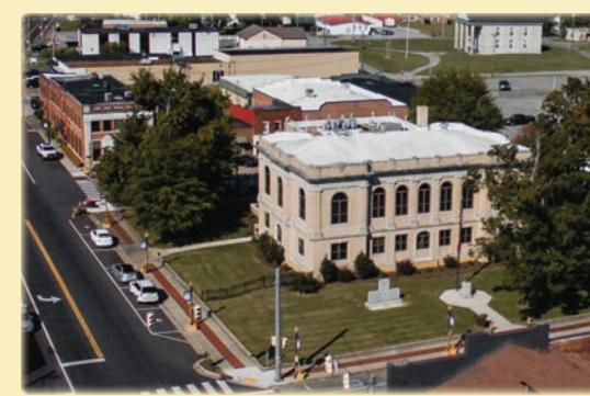
Historic Marion County Courthouse in Jasper, Tennessee

Enjoy local restaurants, shopping, historic sites and authentic Tennessee charm in Marion County, part of the national Sequatchie Valley Scenic Byway.