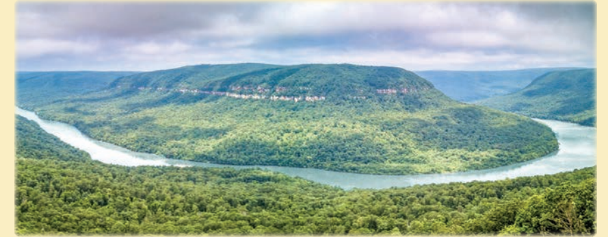
The Tennessee River winds through Marion County forming the stunning Tennessee River Gorge and Nickajack Reservoir, a popular lake for fishing and boating.