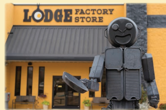
South Pittsburg is home to America's most popular cast iron cookware producer, Lodge Manufacturing. Visit their hometown Factory Store.