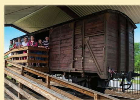
Whitwell Middle School is home to one of the world's most profound remembrances of the Holocaust, the Children's Holocaust Memorial.

grew. The Tennessee River traverses the southern end of the county, with assets such as Nickajack Lake and the beautiful Tennessee River Gorge, the fourth-largest river gorge in the eastern United States. Marion County is surrounded by numerous sections of South Cumberland State Park, Tennessee's largest state park, and other park systems with opportunities for hiking, rock climbing, off-road adventures and more.