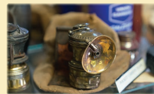
Miner's Carbide Lamp on display at the Coal Miners Museum in Whitwell.

This Back Side area is covered by 1/2 of 8in post