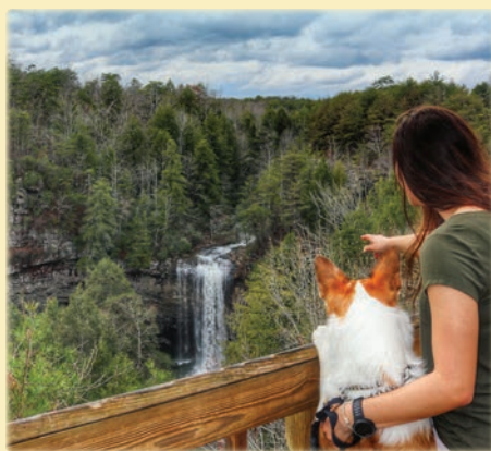
Foster Falls is located within the eastern canyon system known as Fiery Gizzard within South Cumberland State Park.

Marion County's early history includes Native American settlements. In later years, the area was settled by pioneers and railroad infrastructure and mining industries